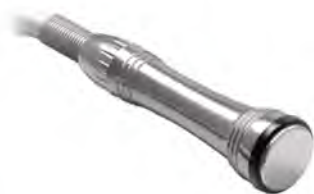
▪ CRYO WORK HAND