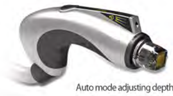
▪ SRF & MRF WORK HAND

The cool handle provides methods for narcotic which use before Microneedle RF treatment